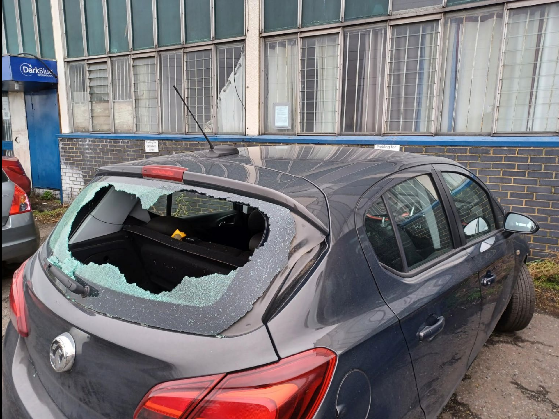
ORD/24 – Damaged vehicle awaiting repair with broken glass.