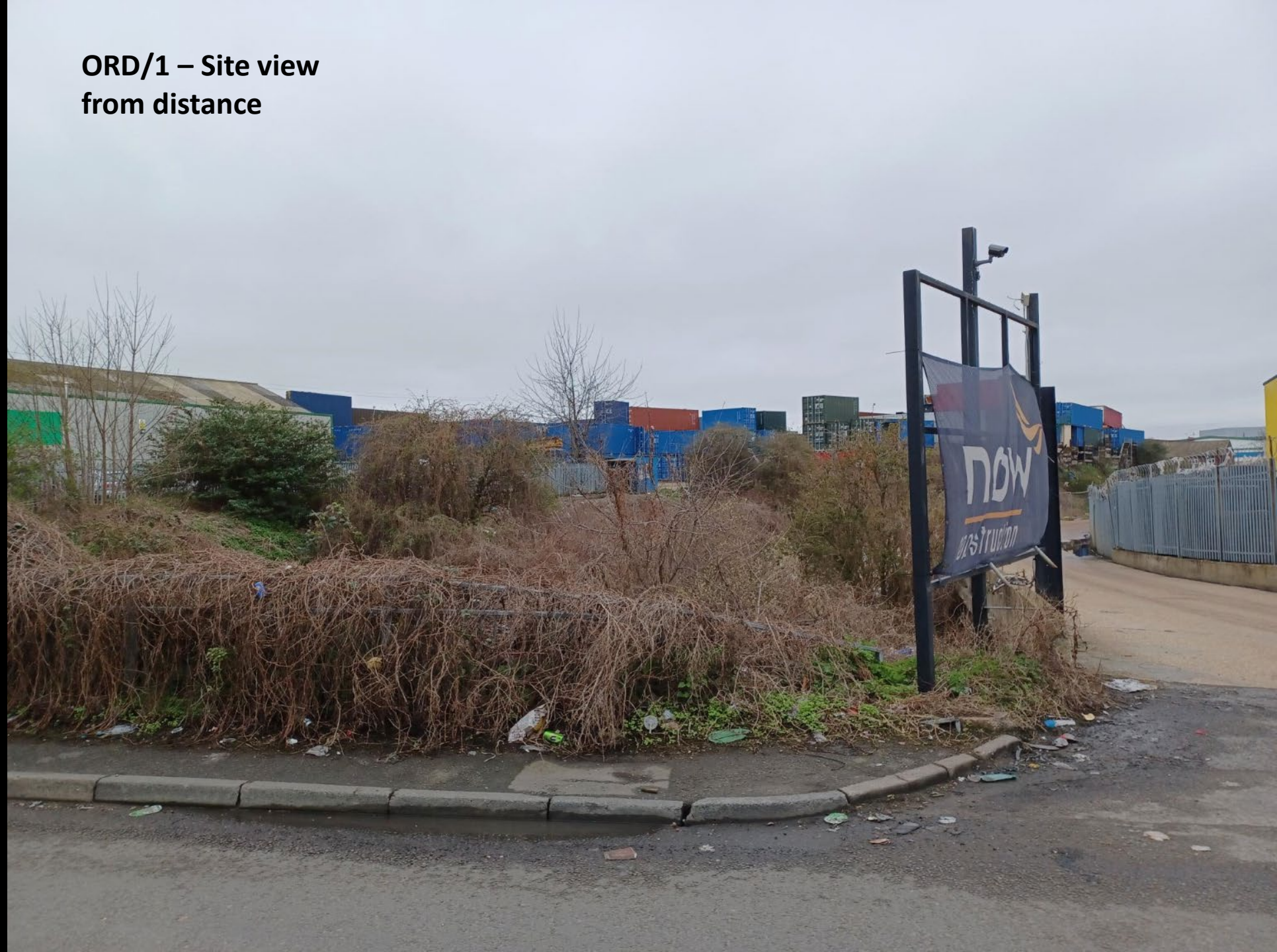
ORD/1 – Site view from distance